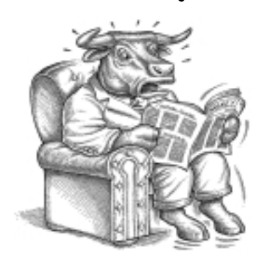
We Can Help! (866) 367-PCMI (7264)

Today's investment environment requires personalized management.